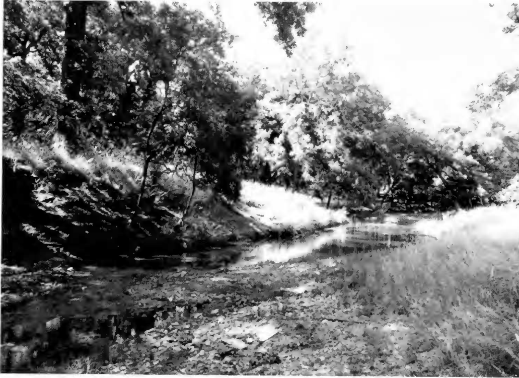
Fig. 7. Riparian forest of pecan at headwater of the South Concho River.

many specimens were deposited in the ASNHC collection of frozen tissues.